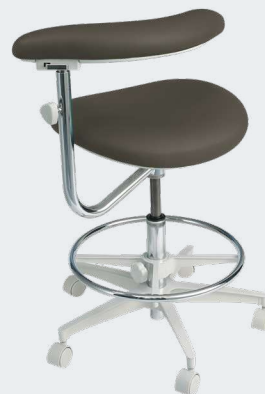
Model 3145R in Gunmetal