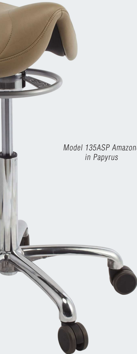
Model 135ASP Amazone in Papyrus