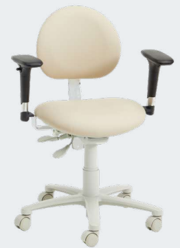
Model 3335BA in Fawn