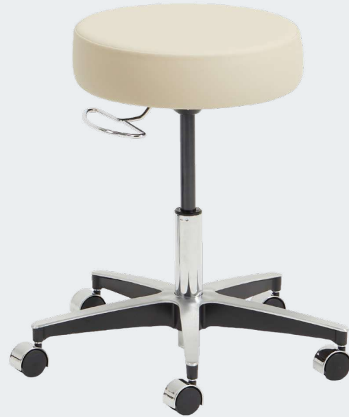
Model 11001-D in Fawn