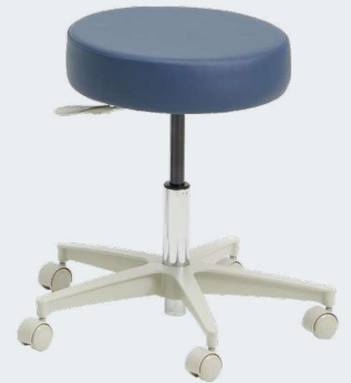
Model 2020 in Deep Sapphire