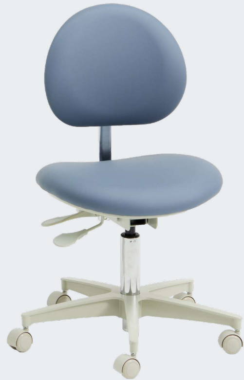
Model 3125B in Blue Fog