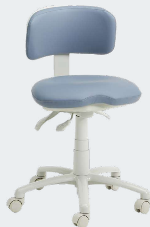
Model 9500B in Blue Fog