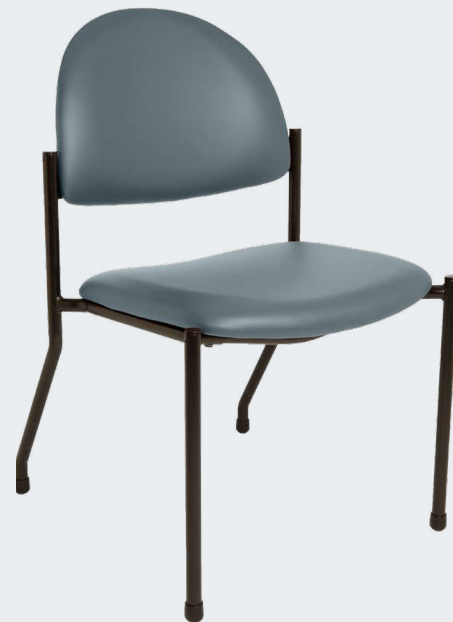
Model 1250 in Blue Fog