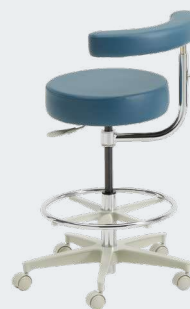
Model 2042L in Slate Blue