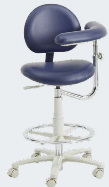
Model 3345BL in Admiral