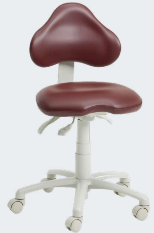
Model 9100B in Burgundy