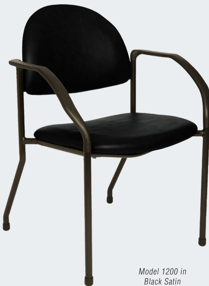
Model 1200 in Black Satin