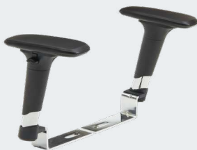
101282 Stool Arms

101282 - Optional stool arms (sold separately)