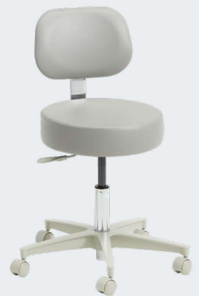
Model 2020B in Dove