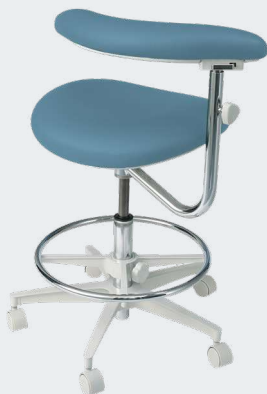
Model 3145L in Wedgewood