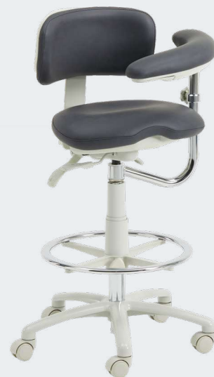
Model 9520BL in Charcoal