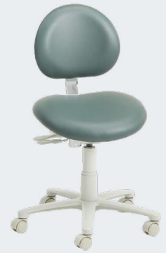
Model 3335B in Shetland