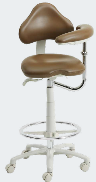
Model 9120BL in Walnut