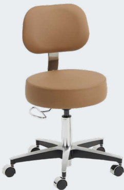
Model 11001B-D in Velvet Brown