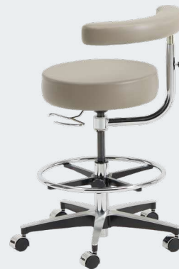
Model 11001FRA-D in Stone