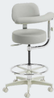
Model 2052BL in Feather